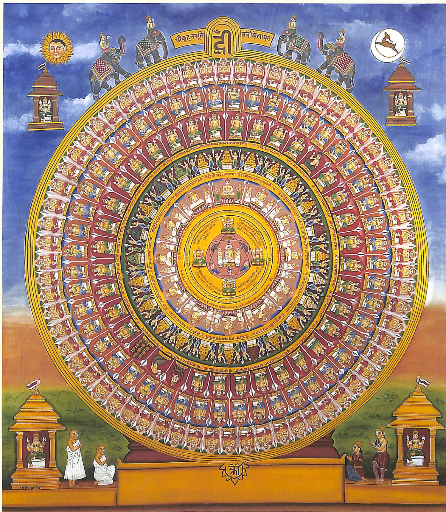
Brihad Surimantra Pata