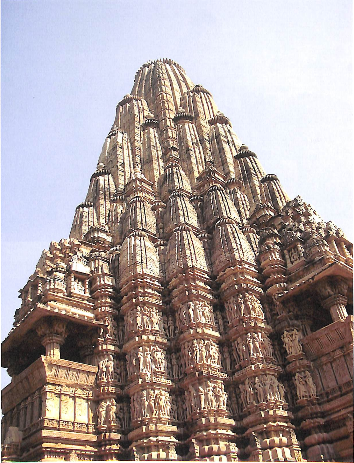
Figure 27: The Great temple Kandariya Mahadeva temple at Khajuraho with its towers soaring high simulating the Meru as if measuring rod of the Universe – Sthitah Prithvyā iva māna daṇḍah